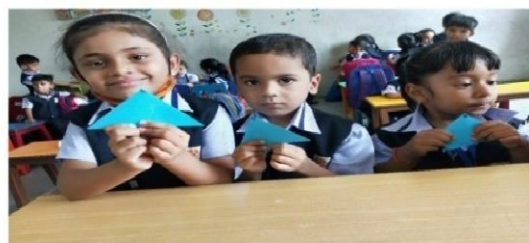
craft : Blue fish